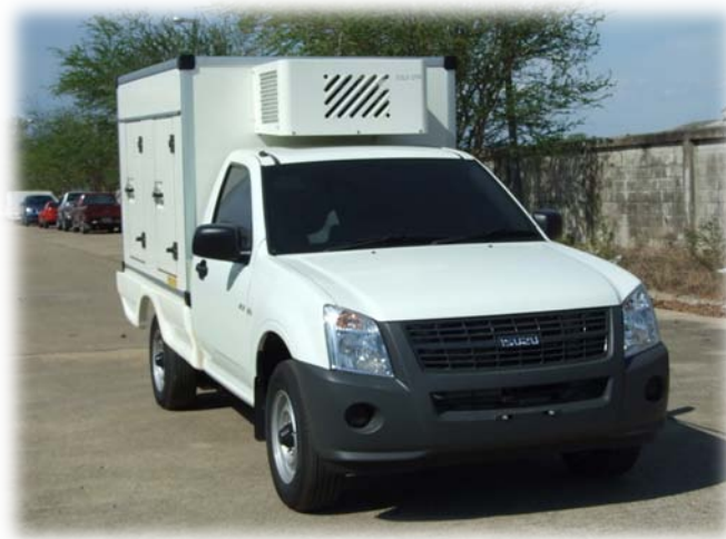
Pick-up box for Isuzu Spark