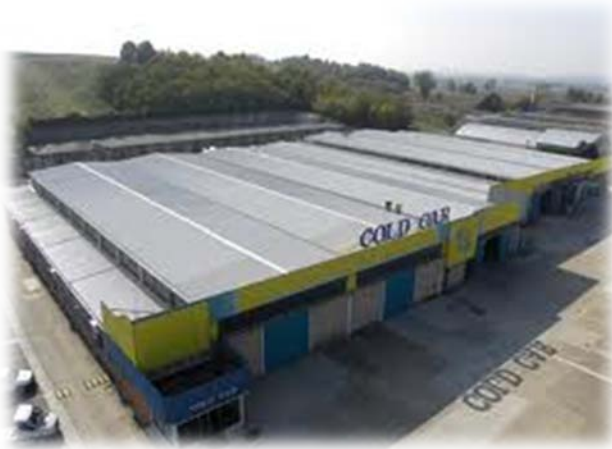
Cold Car Italy